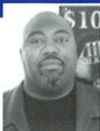
9. William Hathorne